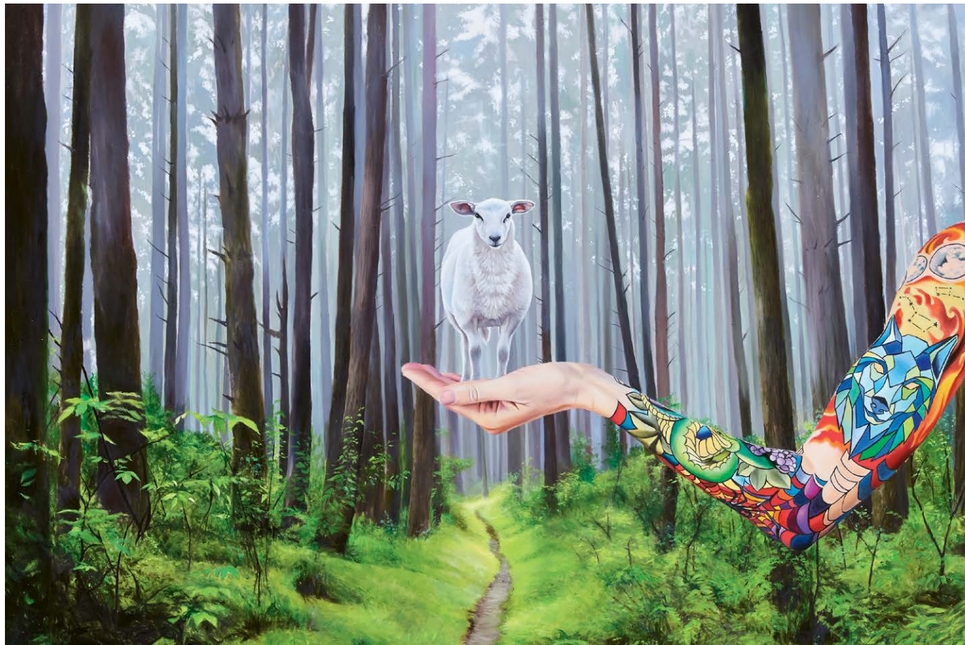
top: Helena Fox Fine Art bottom: Robert Lange Studios