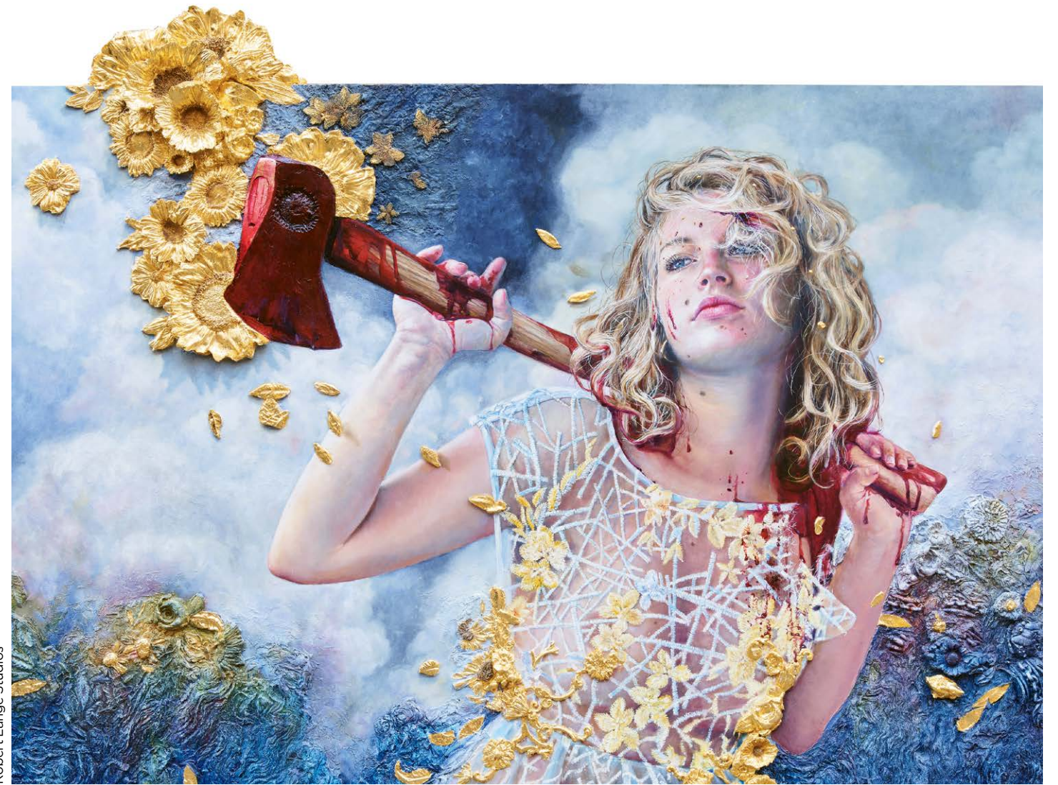
Robert Lange Studios